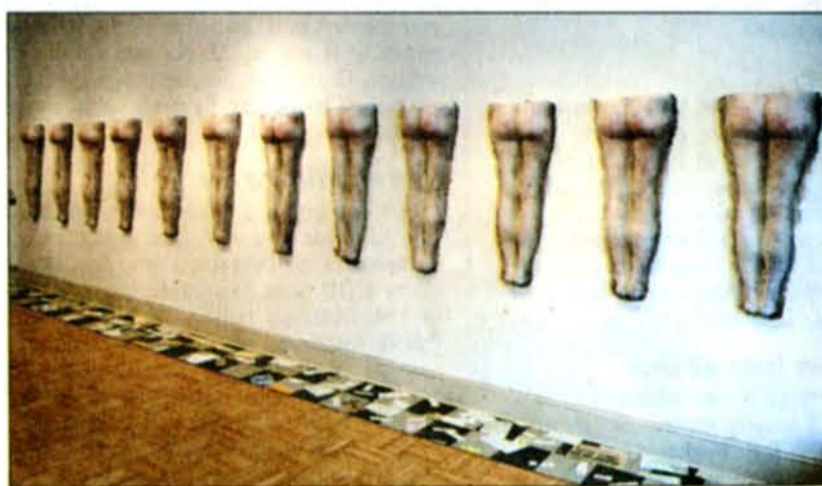
"Bottom Line" from "Previously Occupied: Wall Street Works 1984-1988."